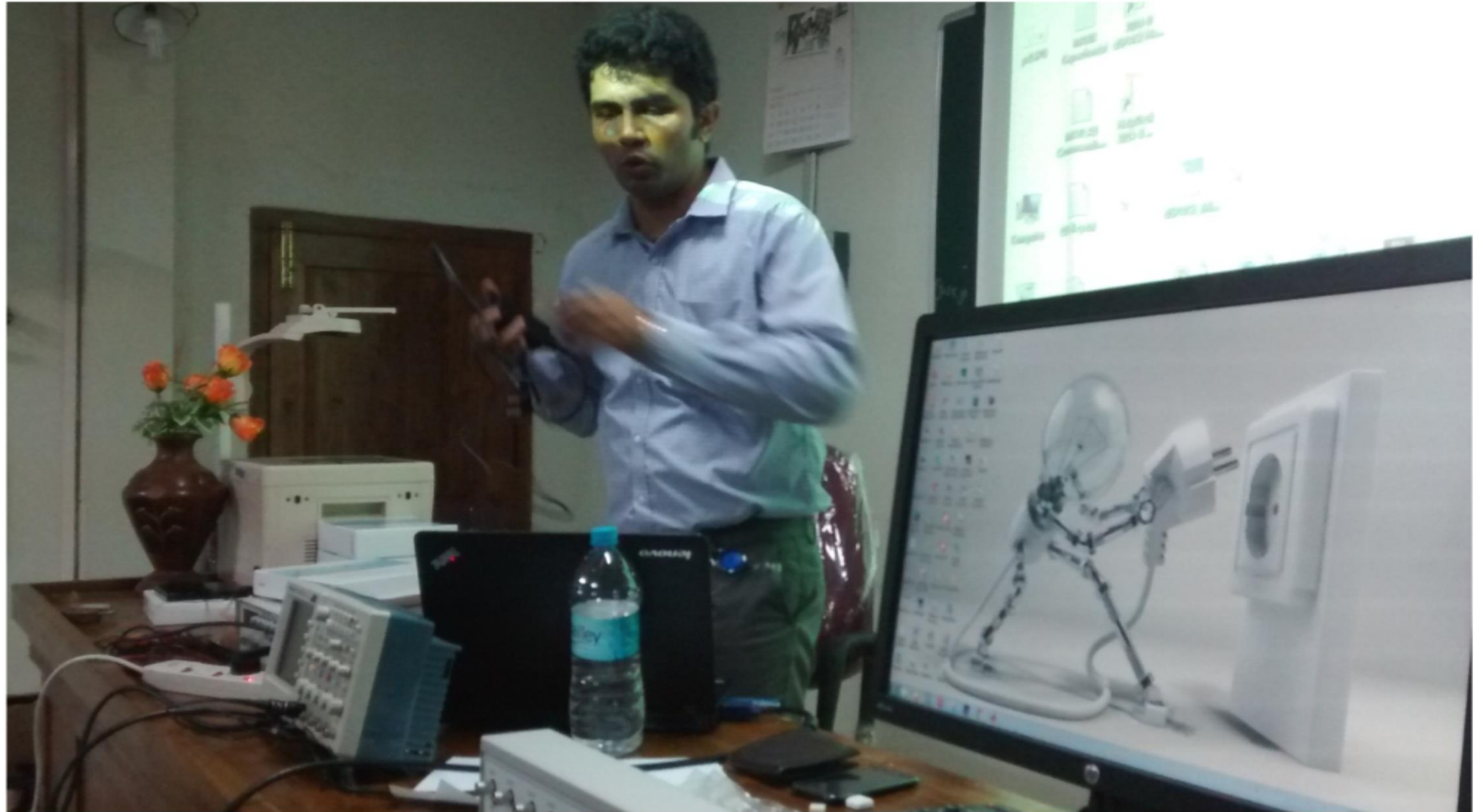
Demonstration of the hardware modules used in dSPACE