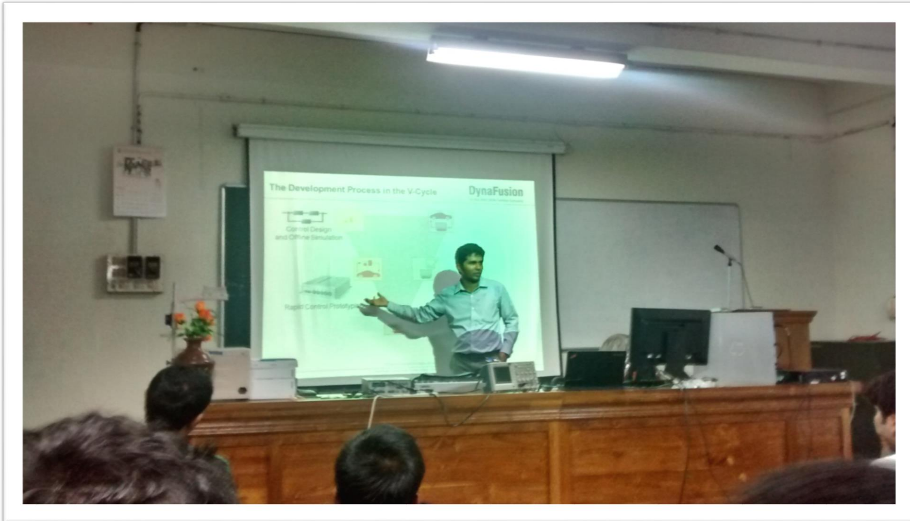
Control Design Development Cycle demonstrated by DynaFusion