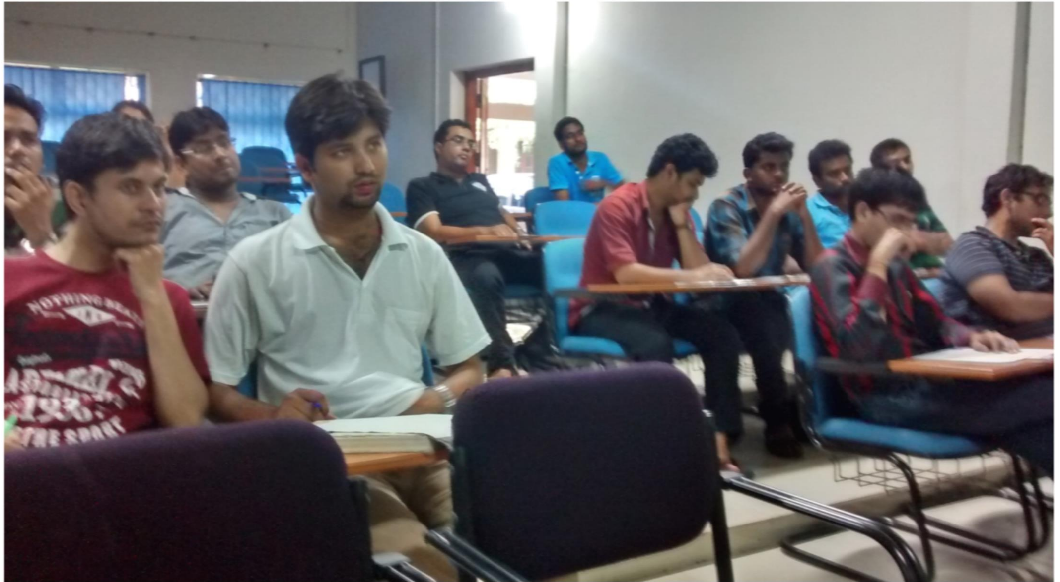
Participants during the training session